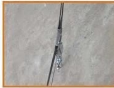
Two Wires Application