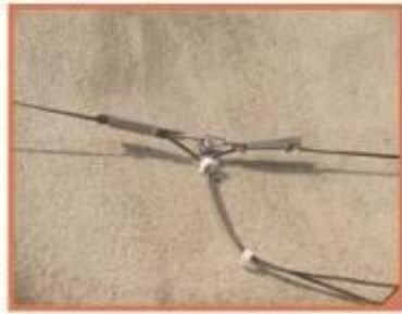
Double Sides Inlets Application