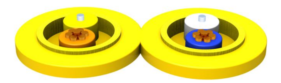
NINGBO SUMMIT TELECOM CO, LTD ALL RIGHTS RESERVED 2012